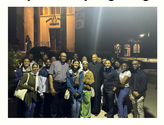
Good Friday Stations