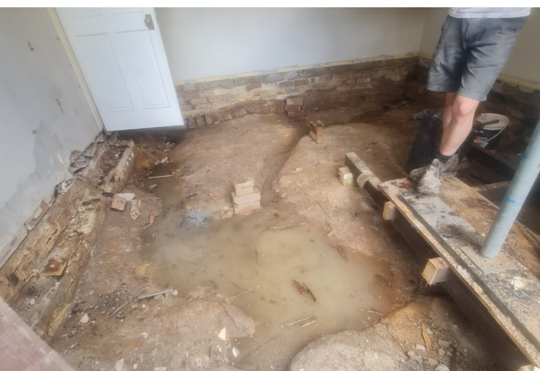
You never know what surprise might be hiding under your house!