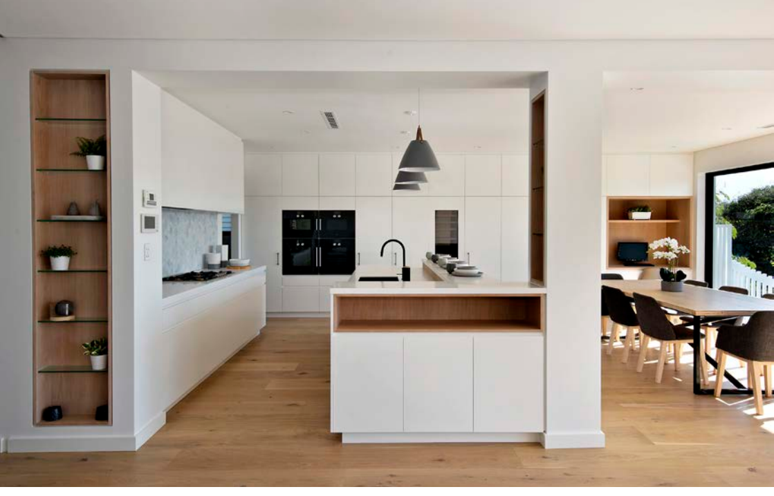
Don't just follow the crowd. Find a palette that works for you .