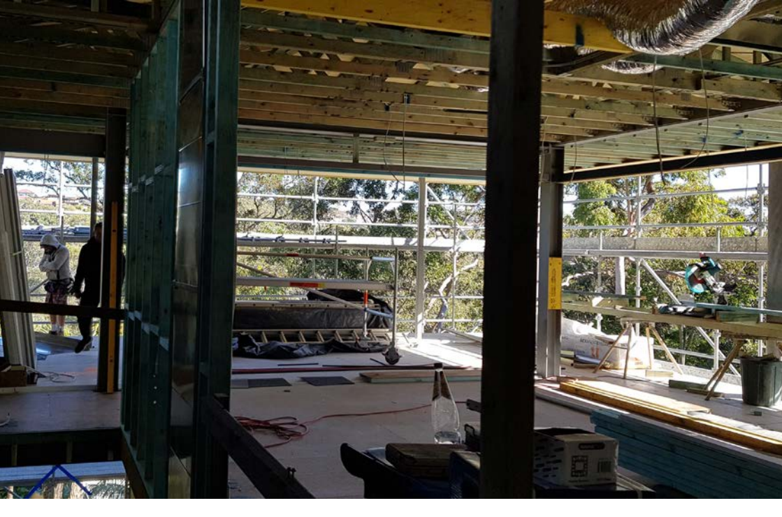
Living through the process of creating your new home may not be for you.