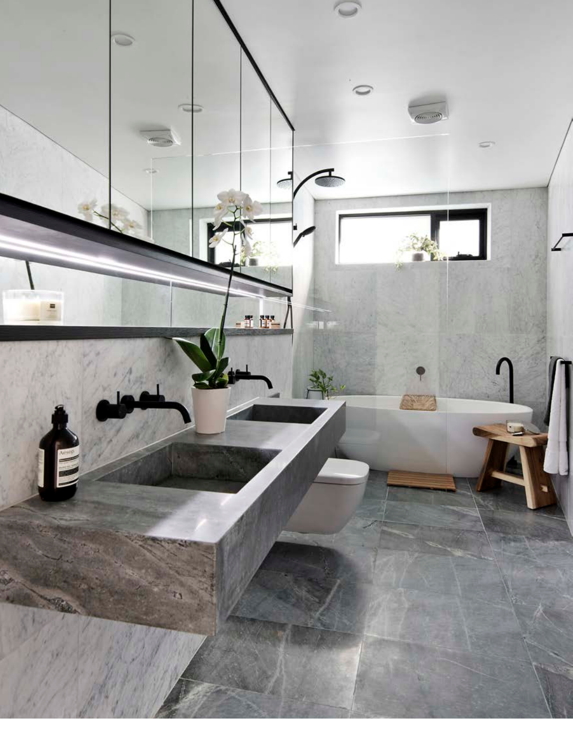
Good design does not have to cost a fortune!