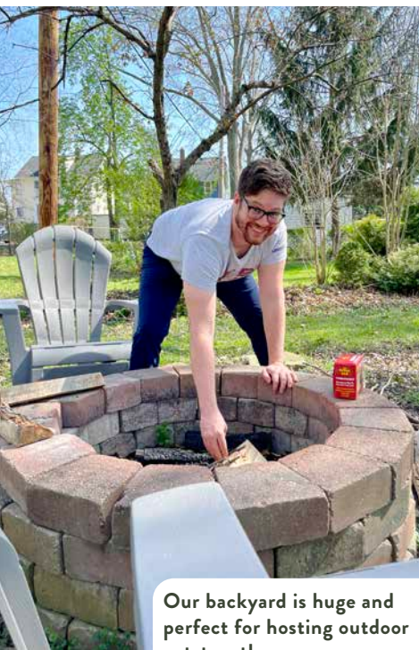
Our backyard is huge and perfect for hosting outdoor get-togethers