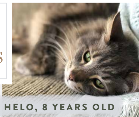
HELO, 8 YEARS OLD