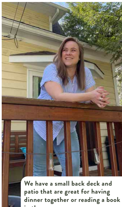
We have a small back deck and patio that are great for having dinner together or reading a book in the sun