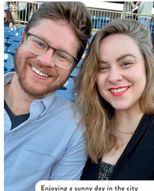
Enjoying a sunny day in the city