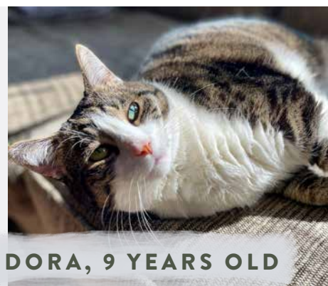
DORA, 9 YEARS OLD