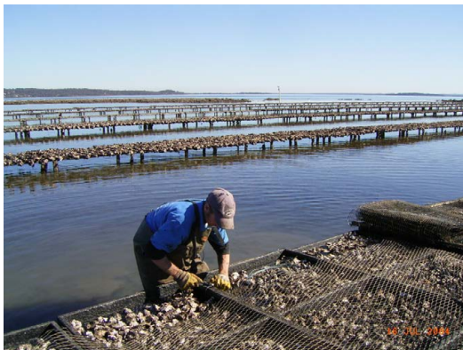
Figure 1: Tray culture of Oysters.

natural sedimentation process by several orders of magnitude [11]. The adverse effects of aquaculture-derived organic matter loads on subtidal benthic assemblages are known [12], so in view of the features of on-bottom and off-bottom culture methods, it is plausible that off-bottom cultures cause more disturbance than on-bottom cultures to intertidal benthic environments. Other potential negative impacts associated with oyster farming include; physical impacts associated with farming structures and farm operations, reductions in native stocks caused by the collection of result wild seed and impacts associated with the introduction of exotic or invasive species, etc as seen in Figure 2. As stated earlier, there is little information on the impacts cultured oysters on the environment except for a few studies on mussels and the northern quahog [1,4,13-17].