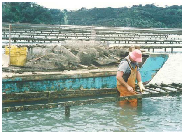
Figure 5: Oyster farm operations are a source of physical disturbance beneath oyster racks.

farms away from the breeding and foraging areas of birds and in high current environments or open coastal situations at sufficient depths such that increased currents and wave action enhances dispersion of farm-generated wastes over a wider area.