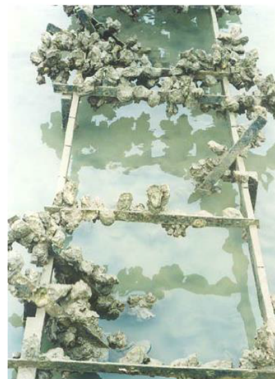
Figure 3: Sediment accumulation beneath oyster racks.

There are great concerns that the widespread movement of cultured species (broodstock, seed, or planting stock) will facilitate the