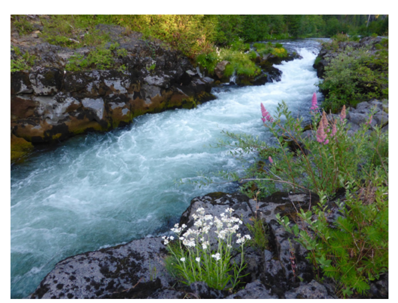
Upper Rogue River with pearly everlasting and spirea flowers.

KS Wild's <u>Special Places</u> program works behind the scenes to advance policy and permanent protections, which may include public lands expansions or designations. Most recently, we are a partner in the <u>Southern Oregon Wildlife Crossing Coalition</u>, which is focused on improving infrastructure and wildlife passages along southern Oregon's Interstate 5 corridor between Ashland and the California state line at the Siskiyou Crest. In addition to this policy work, Special Places engages in stewardship efforts where we mobilize a volunteer base in collaboration with agencies, businesses, and partnership organizations to restore areas damaged by illegal off-road vehicles and to secure