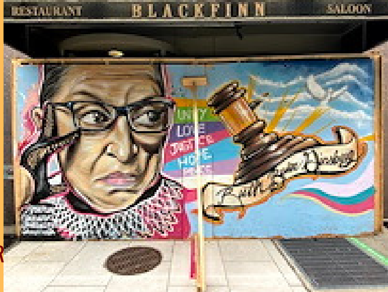
Capital Jewish Museum, Mural of Ruth Bader Ginsberg, 1620 I St NW, Washington, D.C.