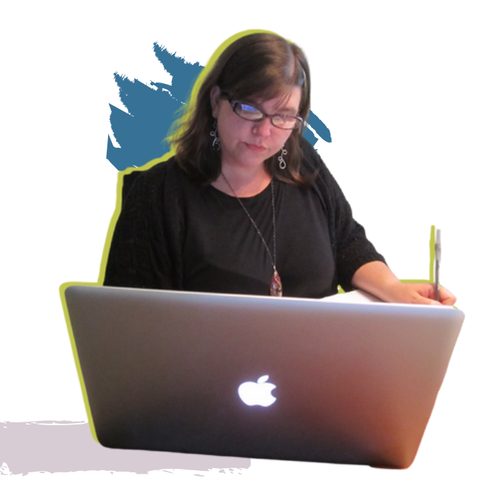
CEO of BizMagic CO.