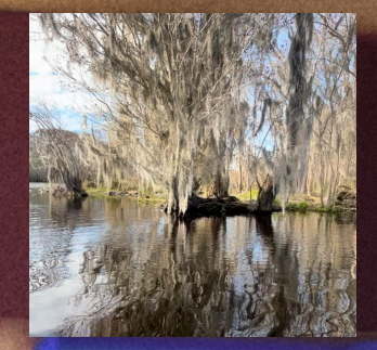
Coming late 2024