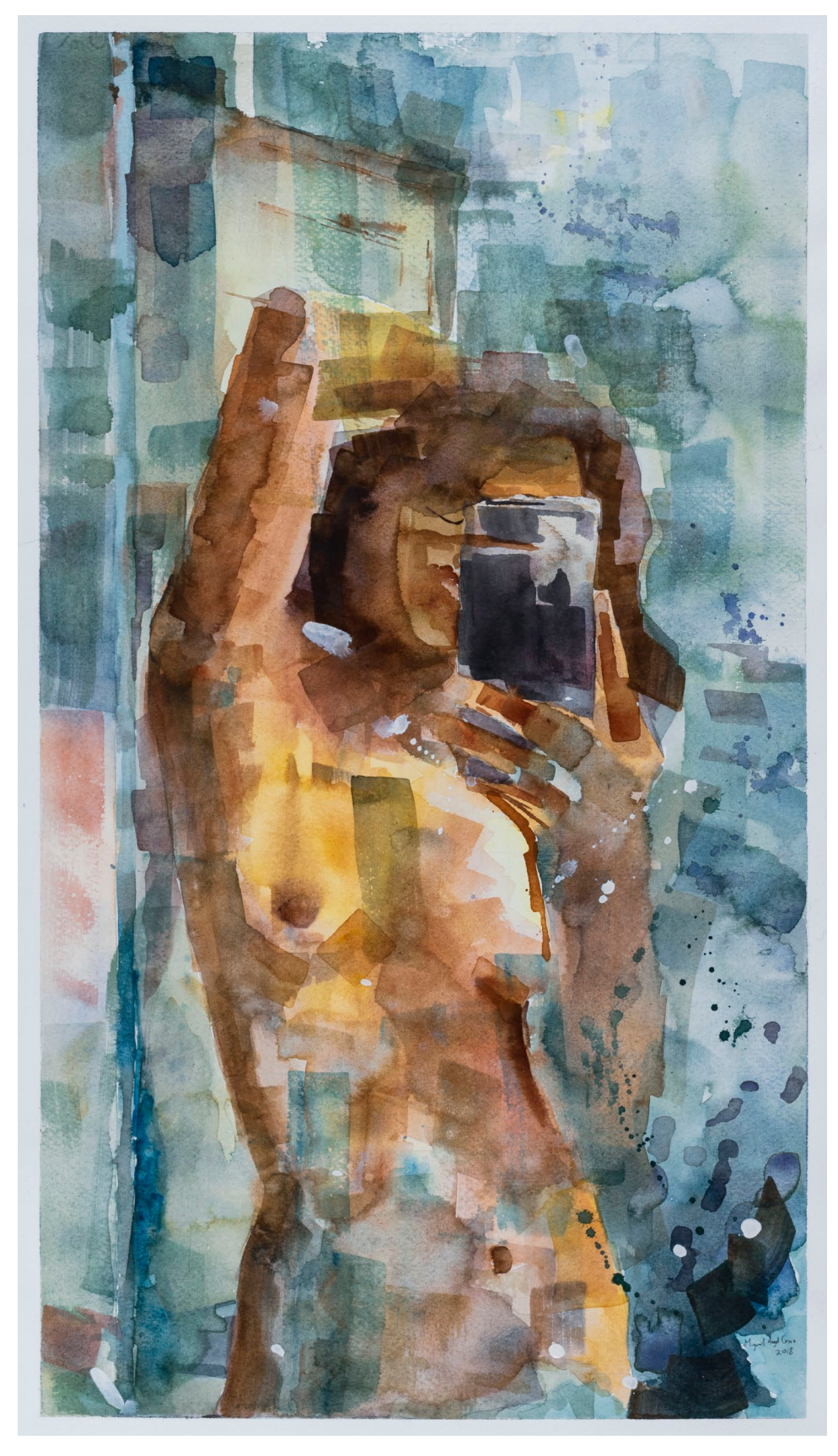
'M.P.' Gouache on paper