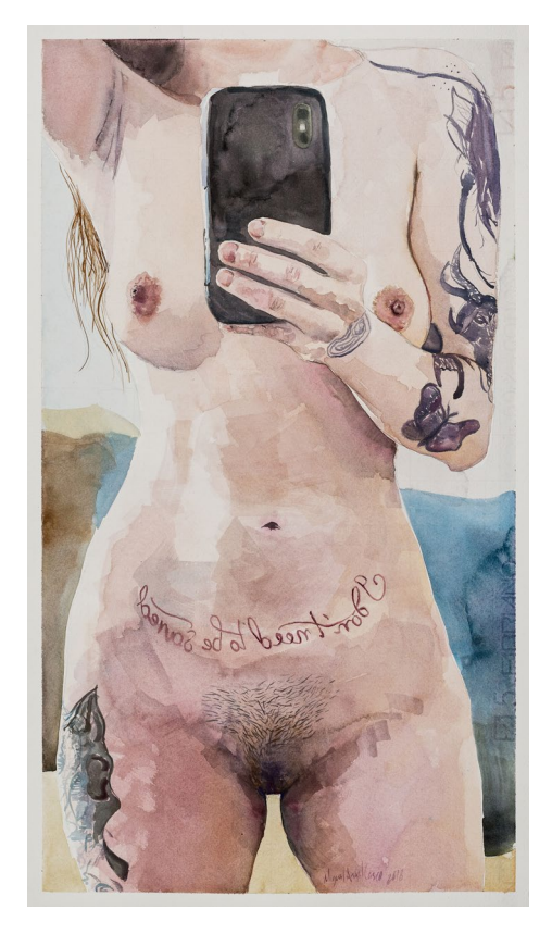
'I.Z.' Gouache on paper