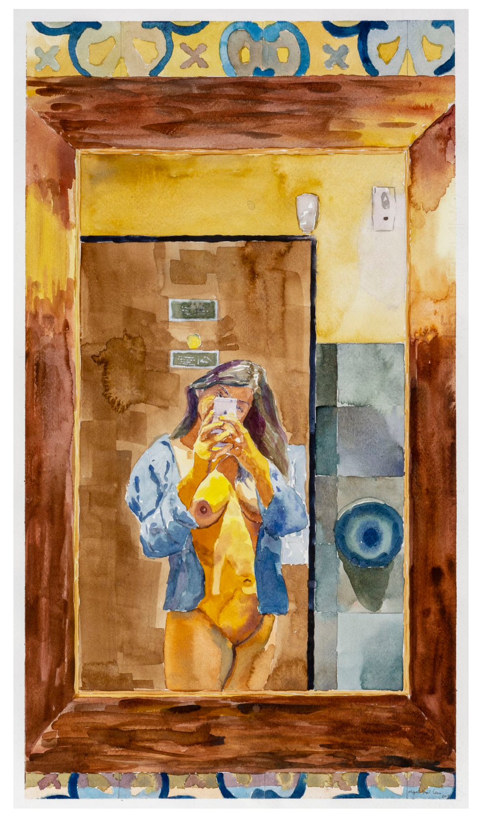
'P.H.' Gouache on paper