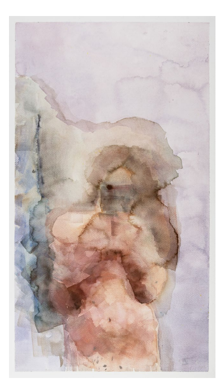
UP 'S.R.' Gouache on paper