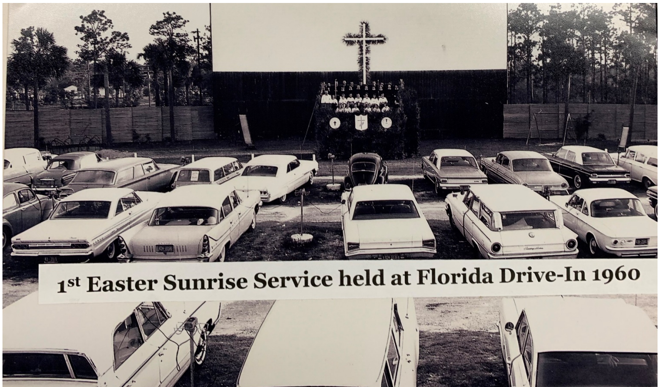
1 st Easter Sunrise Service held at Florida Drive-In 1960