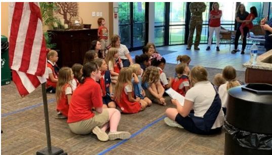
American Heritage Girls Meeting

6/21 – Blowing the Whistle on Abuse 6/28 – Day of the Dead A Mexican Festival