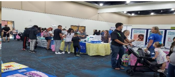
World's Greatest Baby Shower