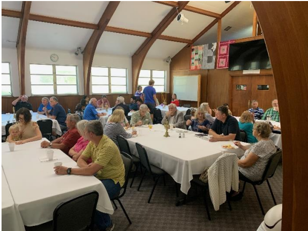
5 th Sunday Breakfast