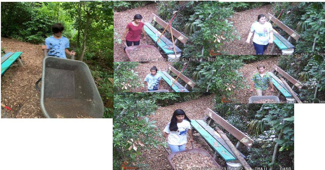
Caught in the act! Taking care of the nature trail