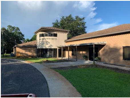
First step of landscaping updates