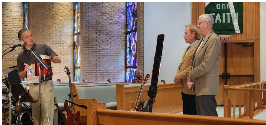
Pastor Appreciation Sunday