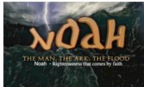
Noah - 1 - The Man