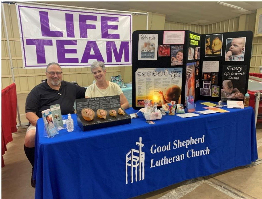
Life Team booth at the fair