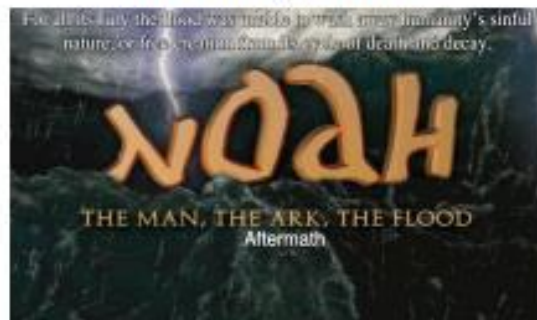
Noah - 4 - The Aftermath