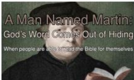
A Man Named Martin - 5 - Out of Hiding