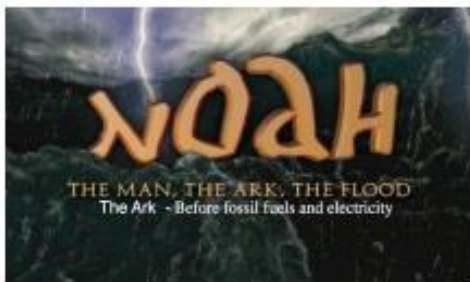
Noah - 2 - The Ark