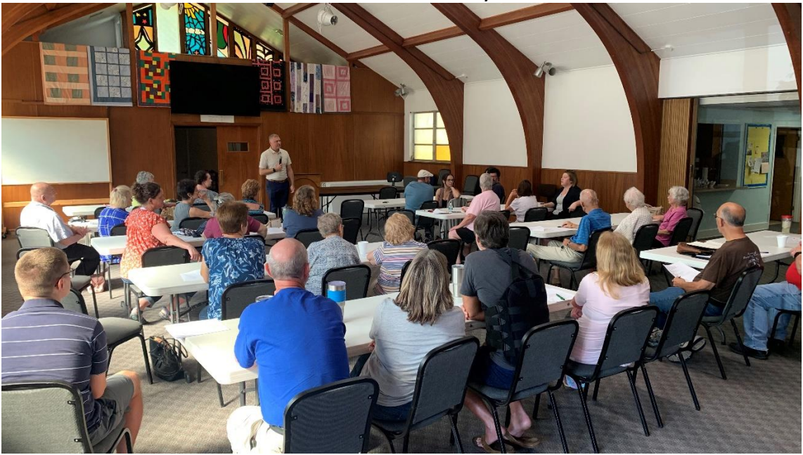
5<sup>th</sup> Sunday Breakfast