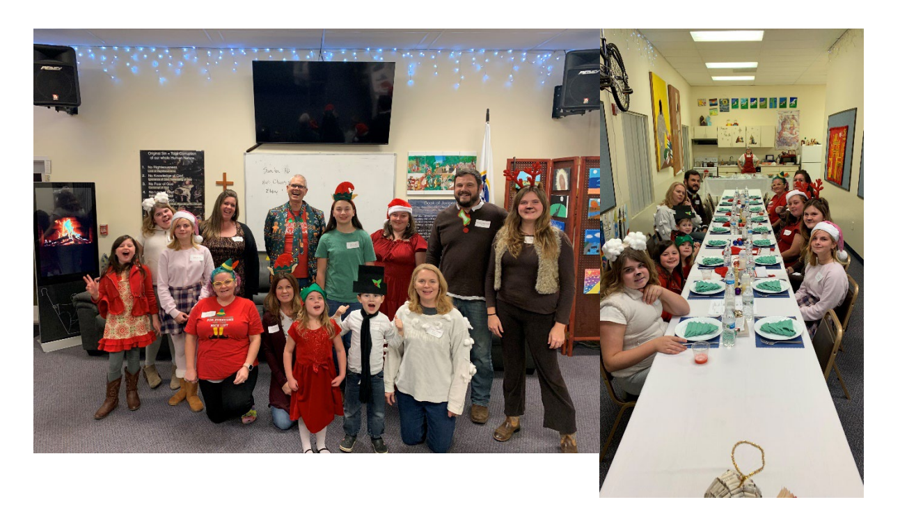
Youth Murder Mystery Dinner