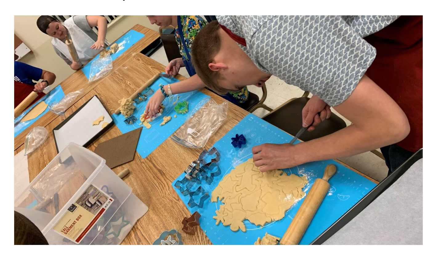
The youth made cookies for the cookie walk