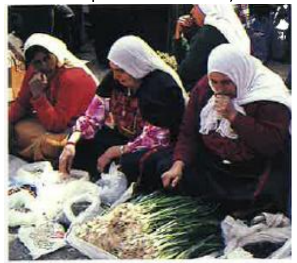
Selling vegetables at Bethlehem market.

VEGETABLES : Vegetables were in common use. Beans and lentils were common throughout the Old Testament period ("Take wheat and barley, beans and lentils, millet and spelt..." Ezekiel 4:9) It was a lentil-based stew that Jacob cooked and