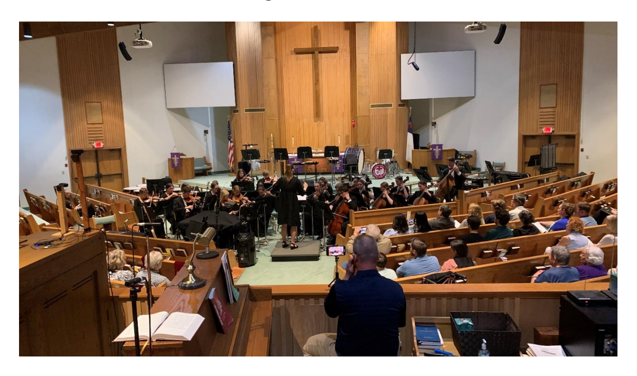
American Heritage Girls