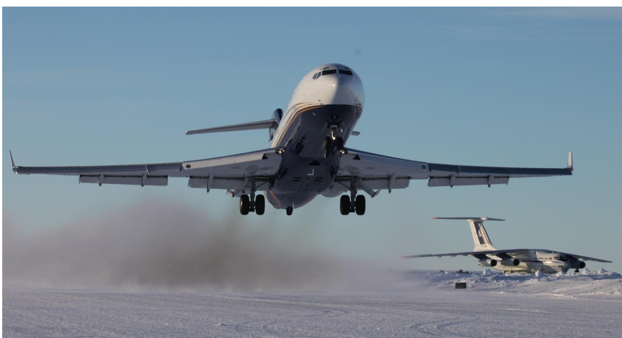
Picture 1: Boeing 727 and Ilyushin Il-76 at Novolazarevskaya Airfield.

Since the beginning of DROMLAN, the aircraft used have undergone an evolution. In the beginning military cargo aircraft such as Ilyushin Il-76, C-130 Hercules, and Lockheed P-3 Orion, were used. Today the runway preparations and airfield infrastructure are of such high standard that they meet the requirements of modern passenger aircraft and private jets. Using commercial aircraft gives the collaboration better possibilities to meet the needs of its members.