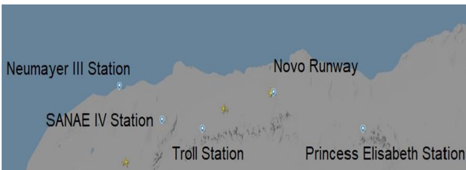
Figure 3: All Intercontinental Airfields and most DROMLAN stations have ADS-B receivers installed which makes real time flight tracking available for everyone.