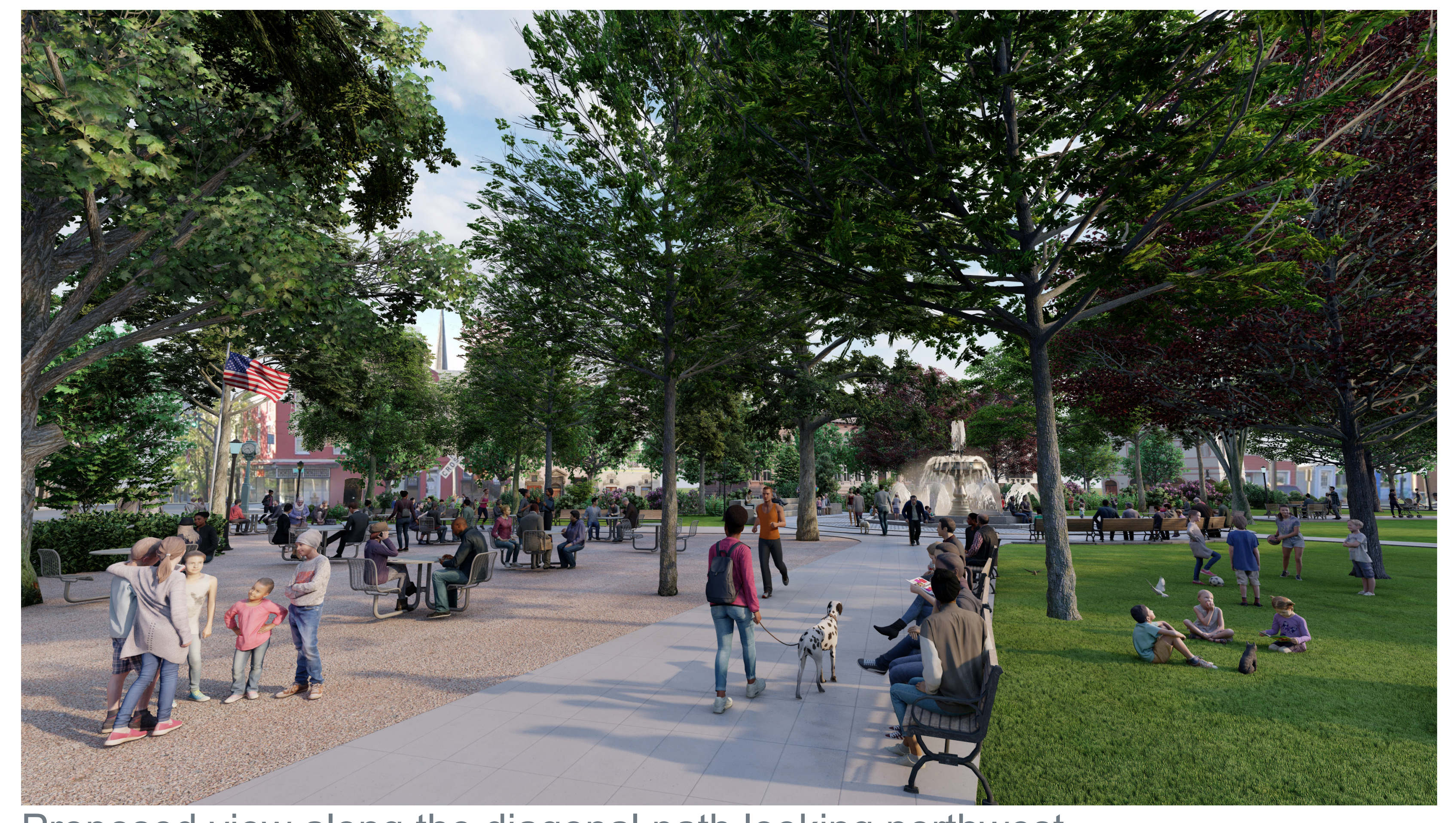
Proposed view along the diagonal path looking northwest