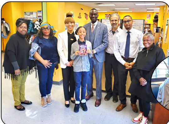
New York City Council Member Yusef Salaam