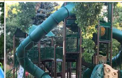
Memorial 8001 W. 59th Ave.