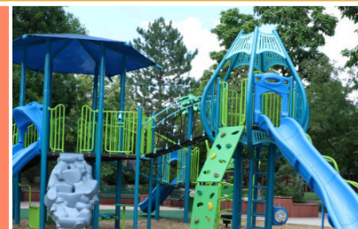
Creekside 5897 Pierce St.