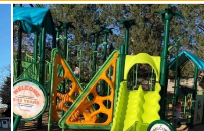
Rainbow Park East 8101 Yarrow St.