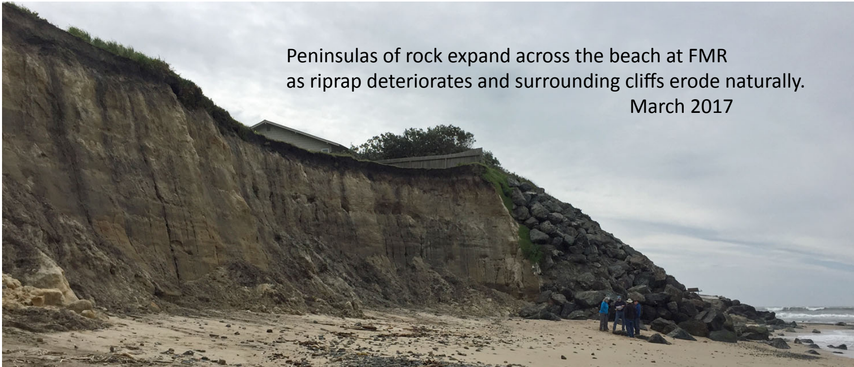
Peninsulas of rock expand across the beach at FMR as riprap deteriorates and surrounding cliffs erode naturally. March 2017