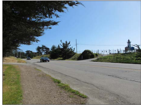
Highway 1, facing south toward the Lighthouse entrance.