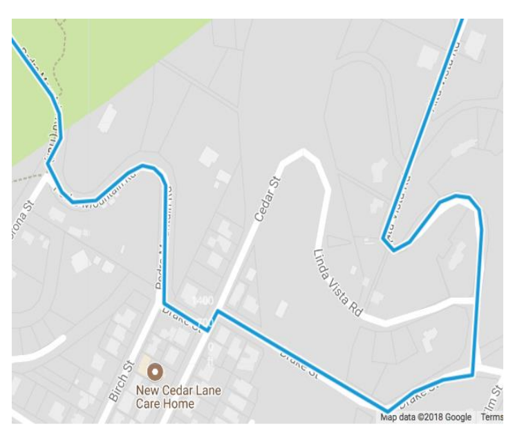
Figure 5 30k and Half-Marathon Trail Run Midcoast Area Detail

Interactive map link: http://www.wandermap.net/en/route/3397441-devils-slide-runhella-hard-half/