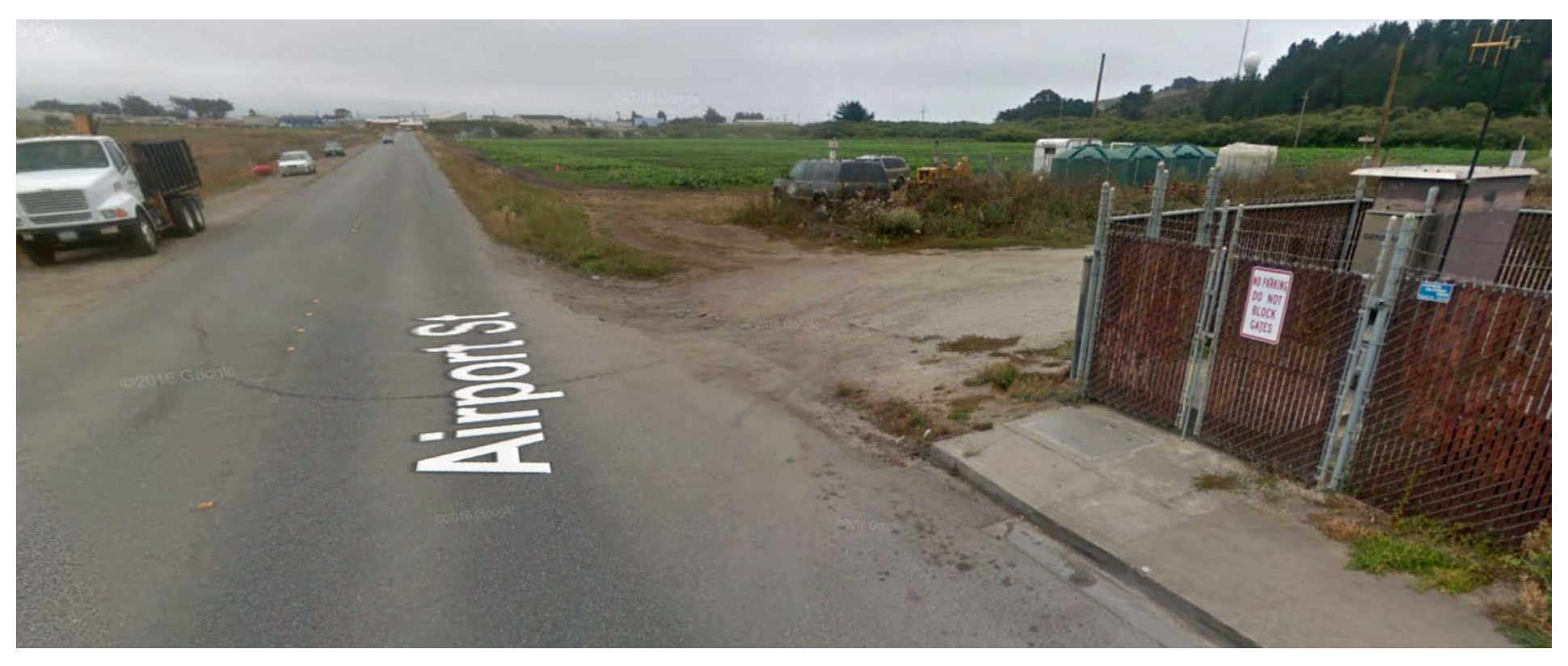
View south toward Princeton from end of sidewalk at MWSD pump station.