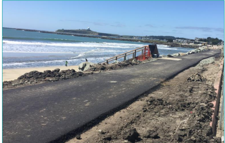
California Coastal Trail west of SR1 at Surfer's Beach.

Temporary flooding or damage from erosion would require the use of side streets, but those roads were not designed to accommodate the traffic demand on SR1. This detour would result in a reduction in level of service. If this segment of SR1 were permanently lost due to erosion or inundation, use of these side streets would not be viable, and recovering the level of service would require significant traffic rerouting.