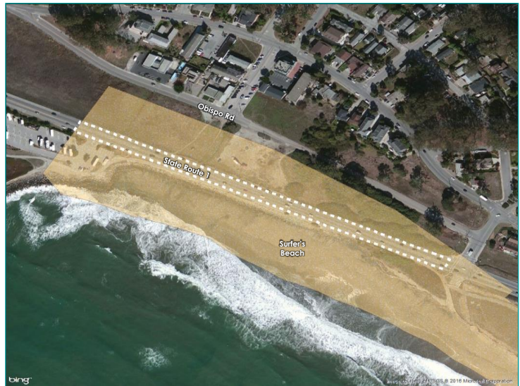
Erosion Extent: Future erosion zone extends far east of SR1.

A force main for the storm sewer runs under SR1 to the SAM Plant in Half Moon Bay (see AVP #2). When the force main backs up from overloads at the treatment plant, there can be a sewage overflow at the open the gates north of SR1 at Surfer's Beach, which then drains through a culvert to Surfer's Beach, forcing the beach to close. Any disruption at Surfer's Beach affects recreation as the site is popular for beach access and offers connection to the California Coastal Trail.