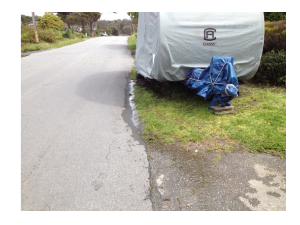
Limiting parking for others and blocking drainage