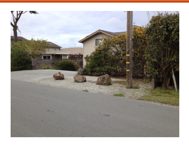
Limiting parking for others.