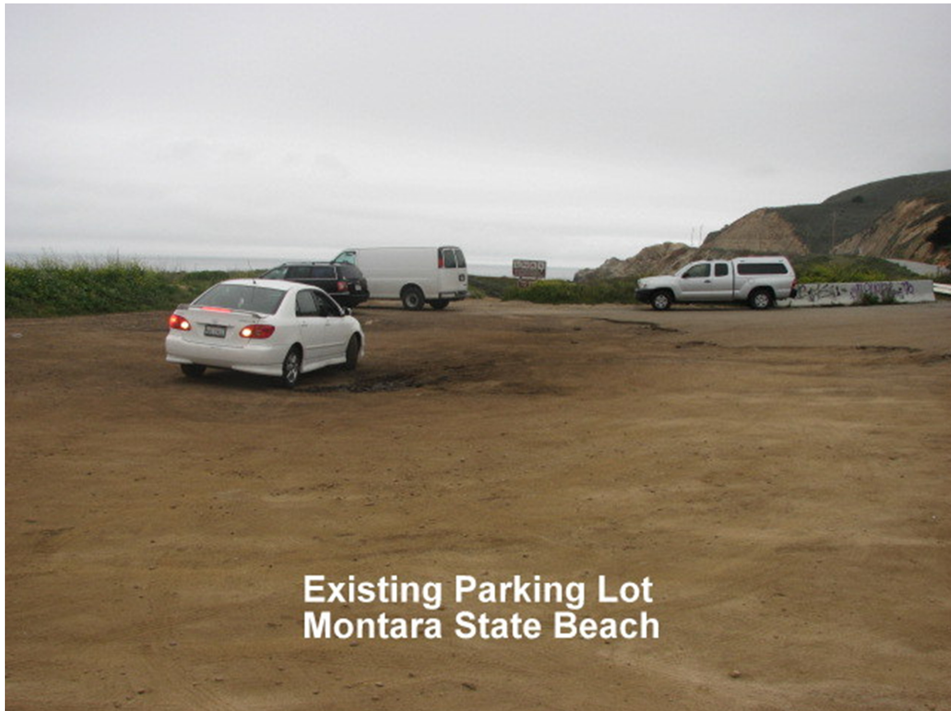
Existing Parking Lot Montara State Beach