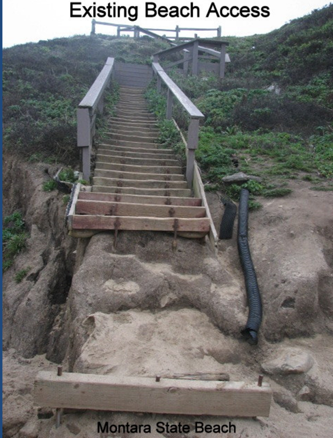
Montara State Beach