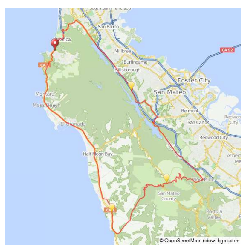
METRIC CENTURY RIDE Link to Map: <u>http://bit.ly/1E1Lqx8</u>