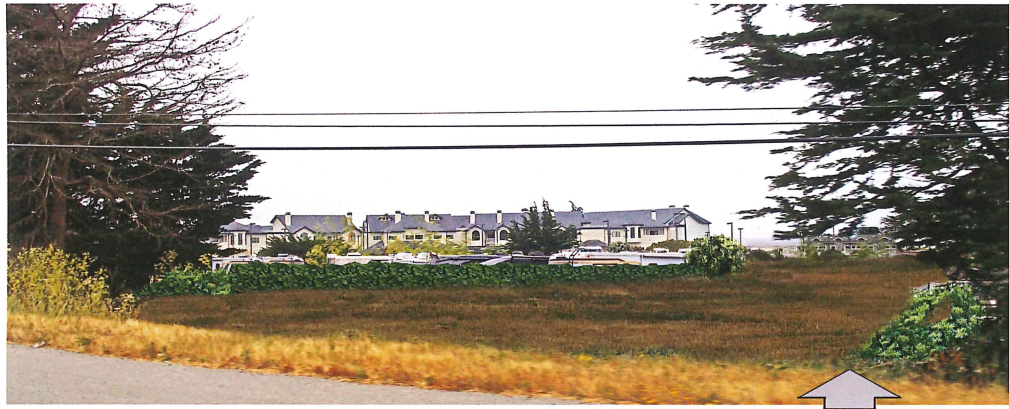
Image Three View from Highway One, southbound, w/ landscape screening