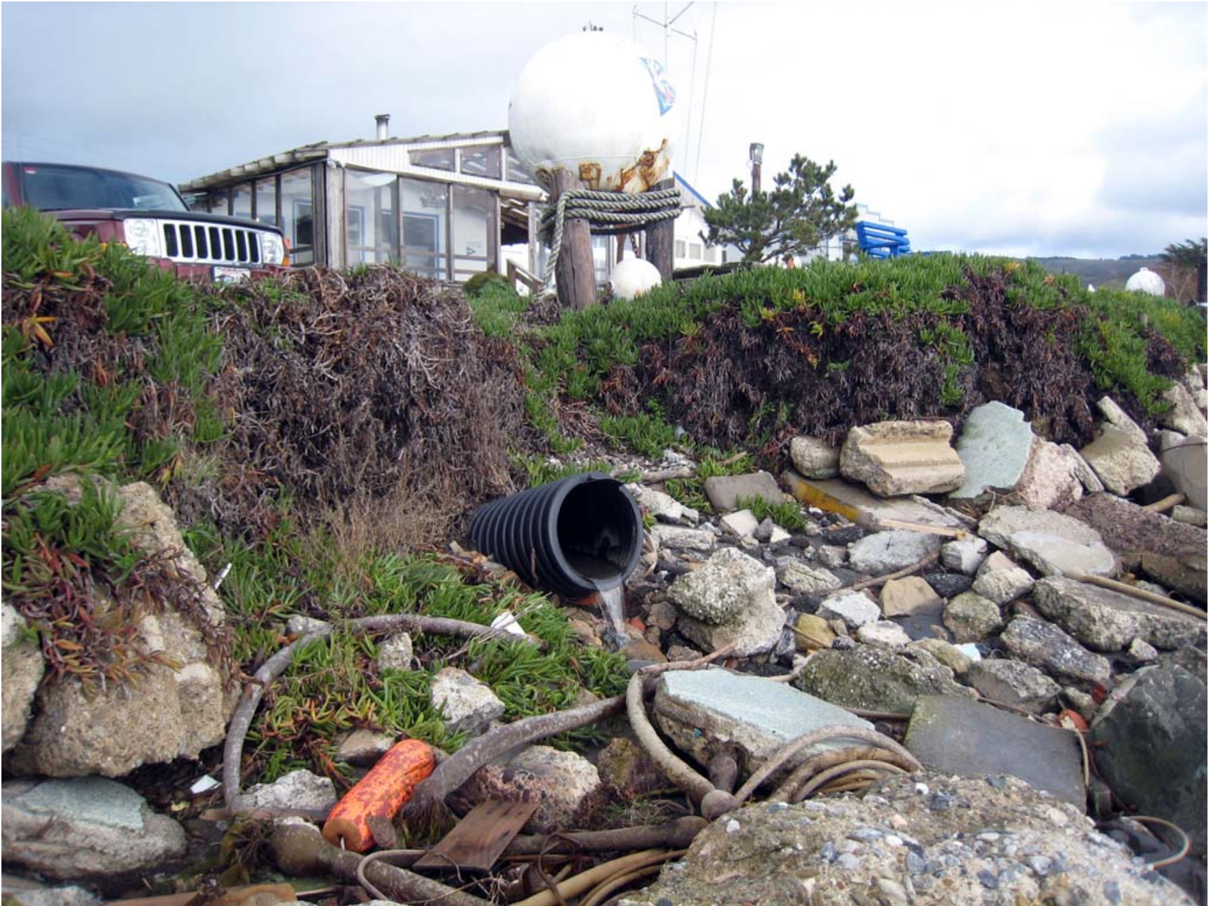
Vassar shoreline access - 2010