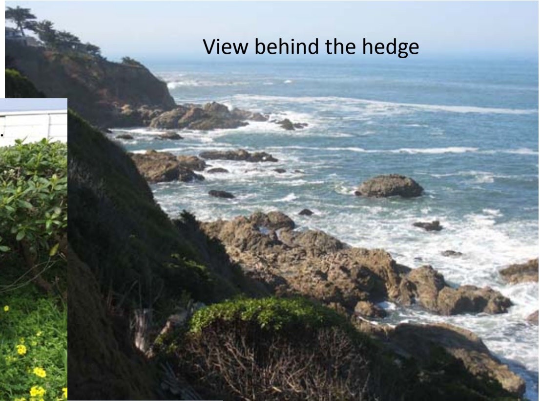
View behind the hedge

Heavily pruned hedge laced with barbed wire.