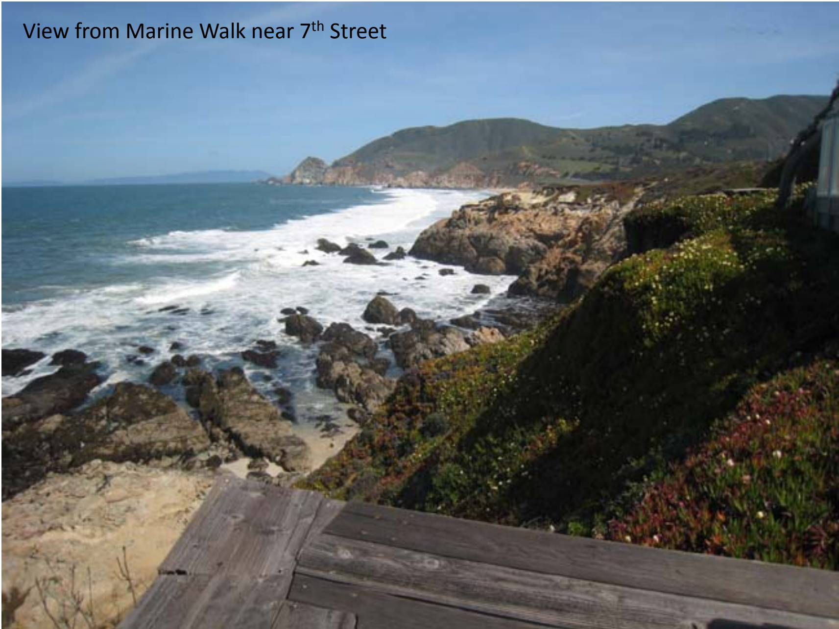
View from Marine Walk near 7 th Street