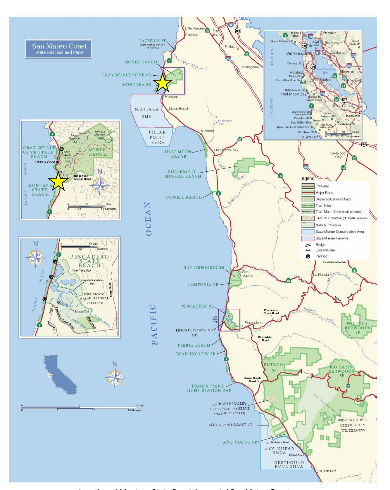
Location of Montara State Beach in coastal San Mateo County.