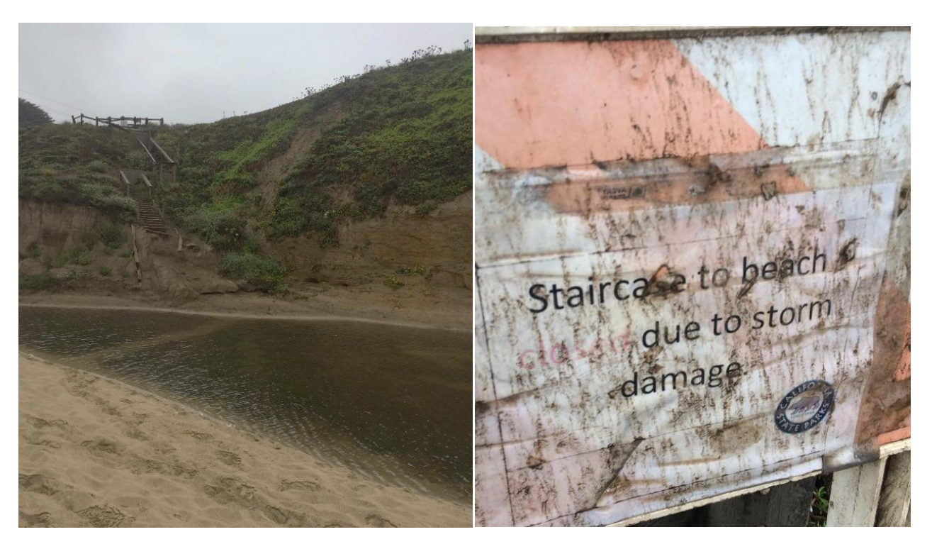
Closed stairway that previously provided access to the beach.