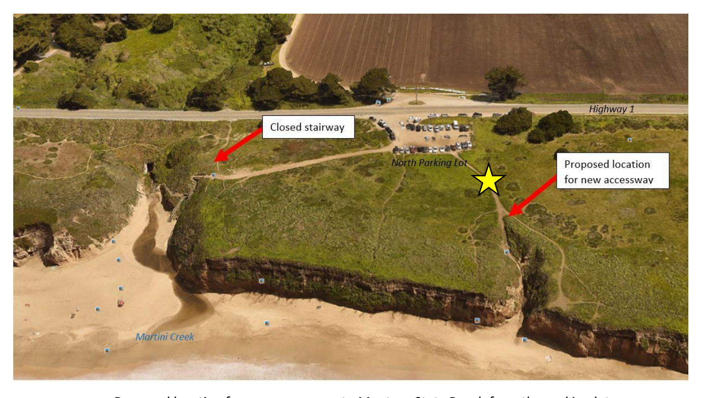
Proposed location for new accessway to Montara State Beach from the parking lot.