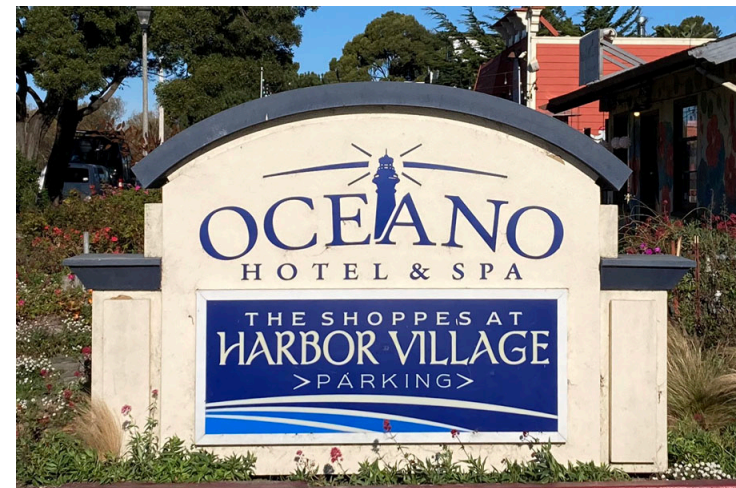
Monument sign at rear entrance to Harbor Village is 6'H x 9'W