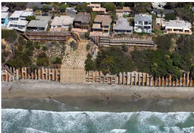
Figure 6. Armoring marring the shoreline in Encinitas, in northern San Diego County, 2010. 38