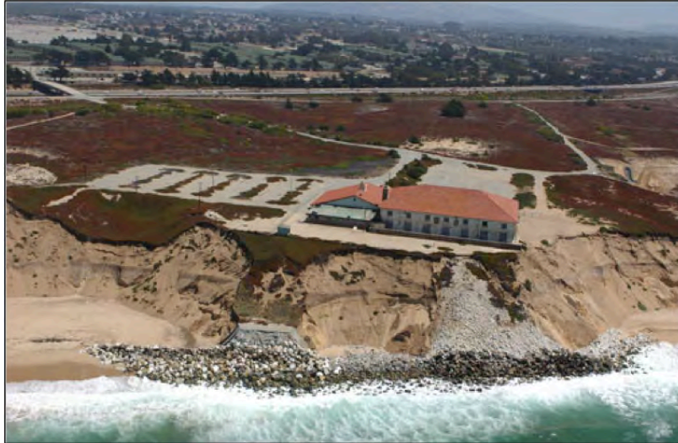
Figure 3. Revetment protecting Fort Ord showing placement loss, end effects, and impoundment loss. 33