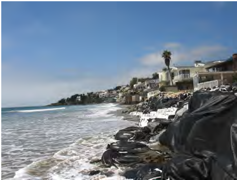
Figure 5. Under winter beach conditions, these temporary protection structures in Malibu significantly reduced lateral and vertical access.

Wave reflection off the armoring structure can also degrade the quality of a surfing area or make it unsafe for swimmers to enter the water, further diminishing recreational opportunities. 36