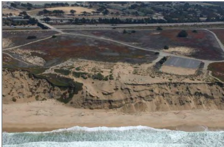
Figure 4. Once the building and revetment were removed, the beach recovered. 34