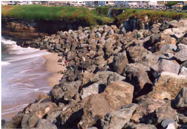
Figure 1. Revetment in the city of Santa Cruz showing placement loss eliminating nearly the entire beach. 26

Shoreline armoring produces several impacts that limit sand supply and reduce the width of the beach. First, the beach area under the footprint of the actual armoring structure is lost. This is known as placement loss (see Fig. 1). For example, rock revetments can occupy over 30 feet of beach width along their entire length. 25