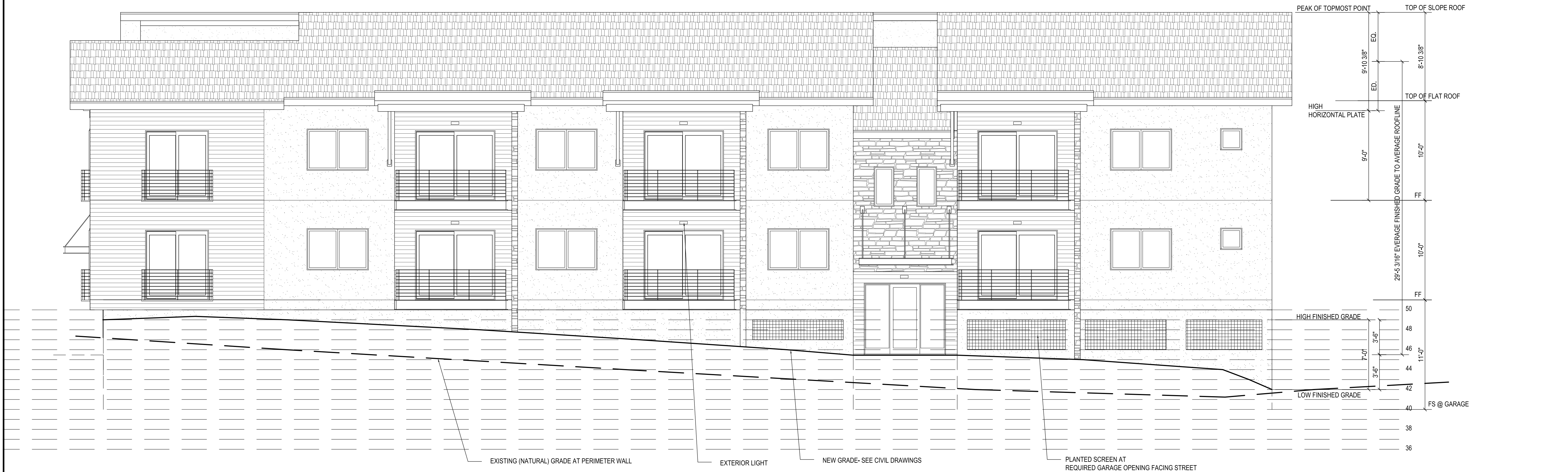
2 CORONADO STREET ELEVATION 3/16"=1'-0"