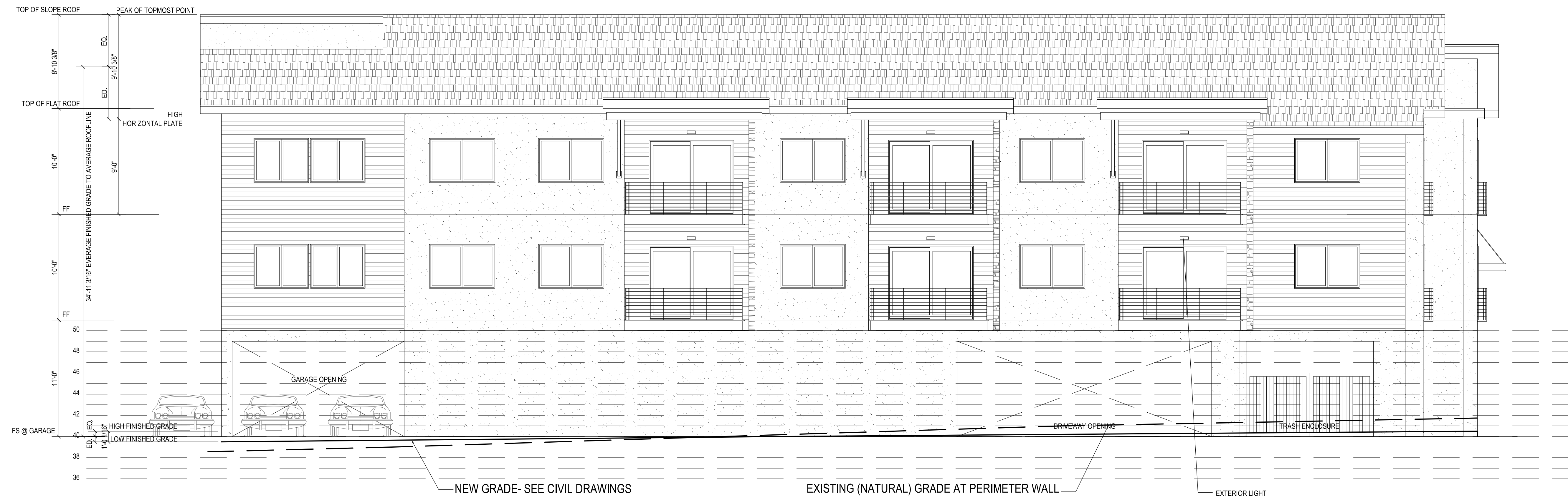
2 SOUTH ELEVATION (REAR) 3/16"=1'-0"