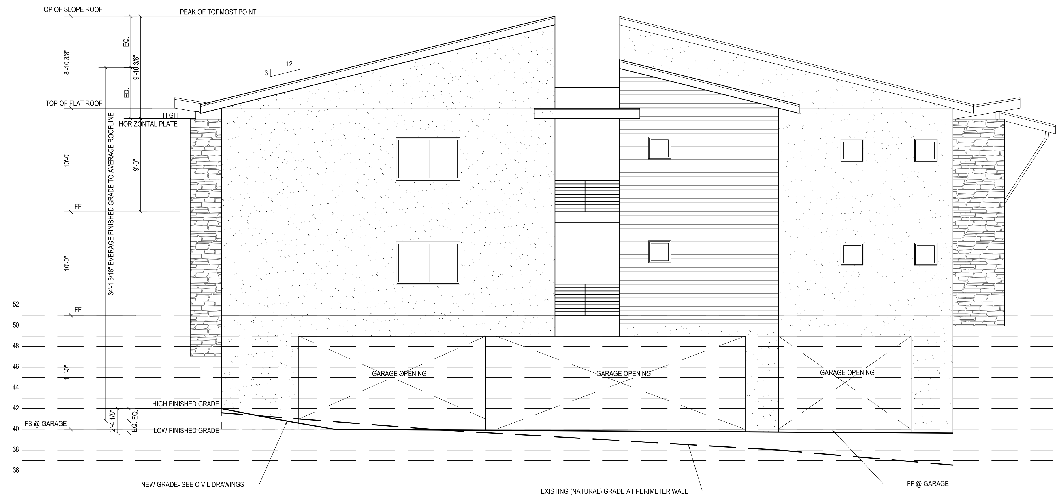
1 WEST ELEVATION (INTERIOR SIDE) 3/16"=1'-0"