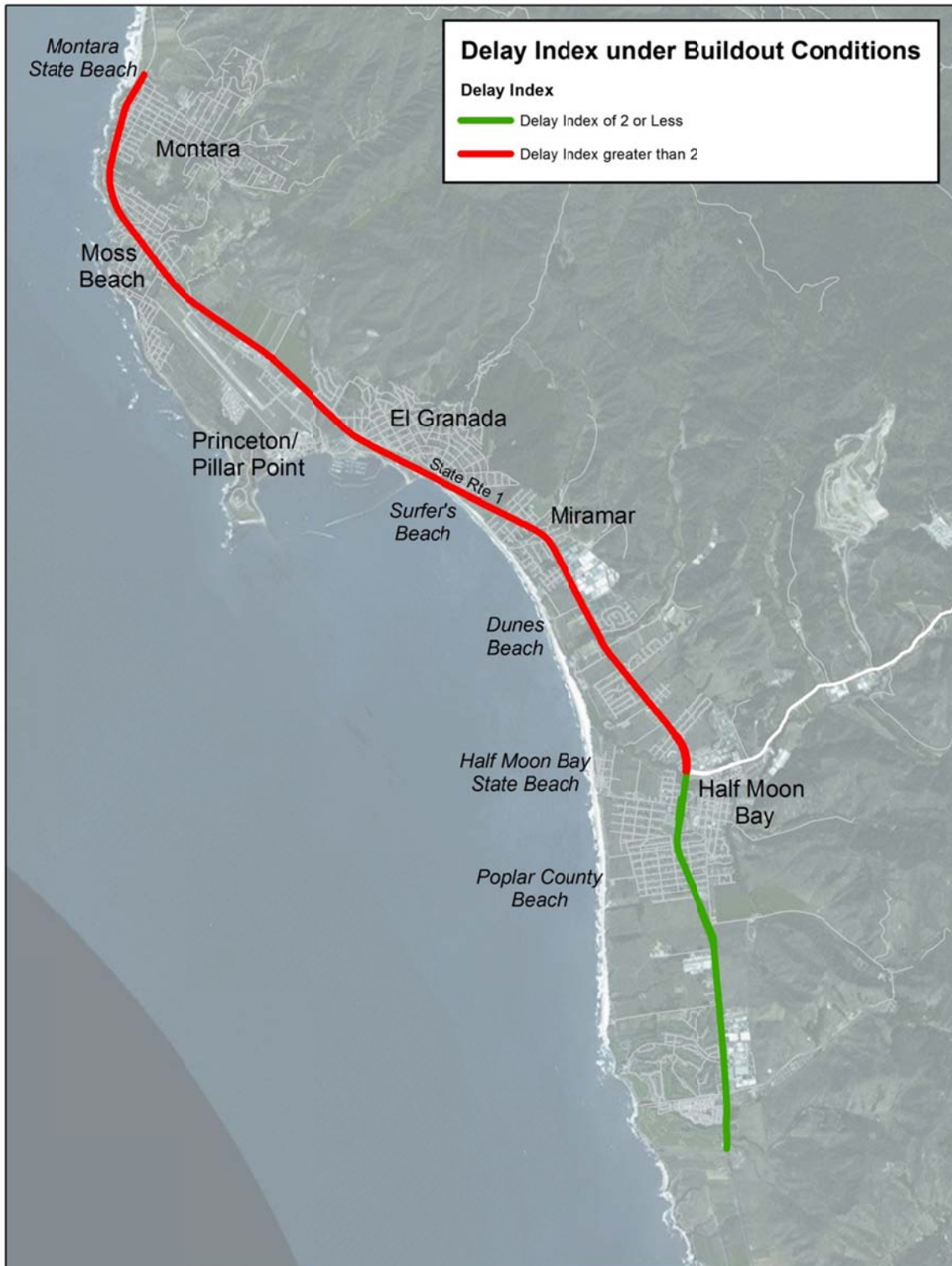
Figure 1 - Delay Index along Highway 1