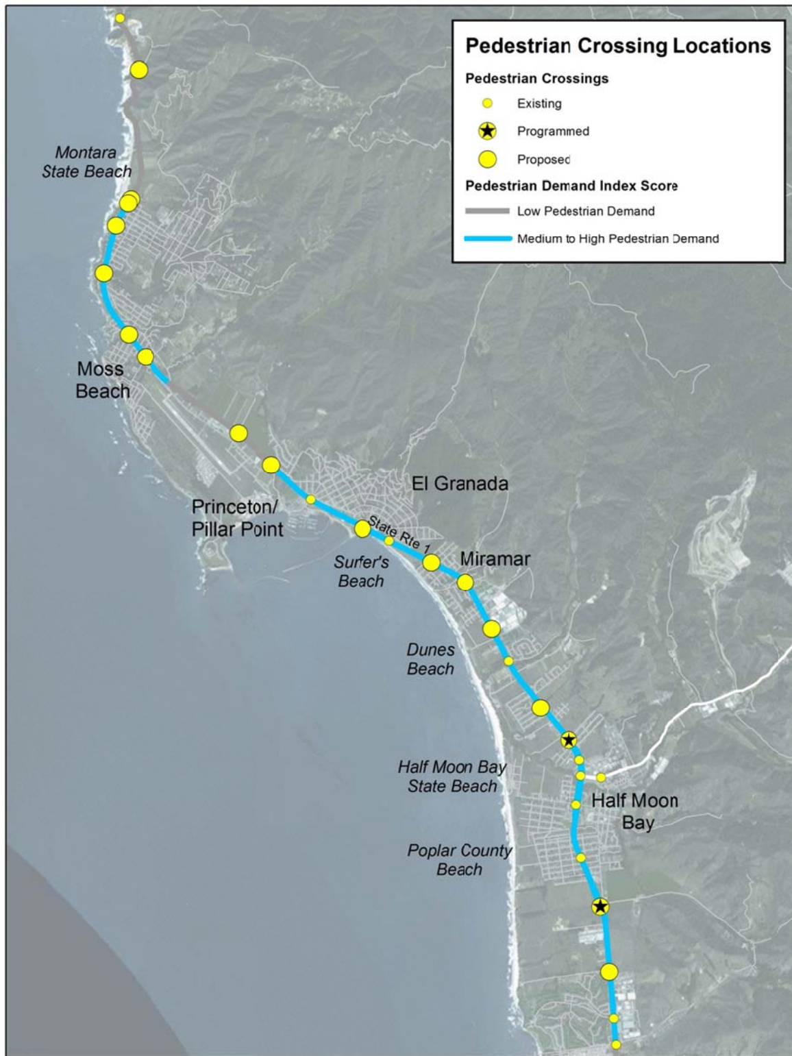
Figure 4 - Proposed Pedestrian Crossing Locations