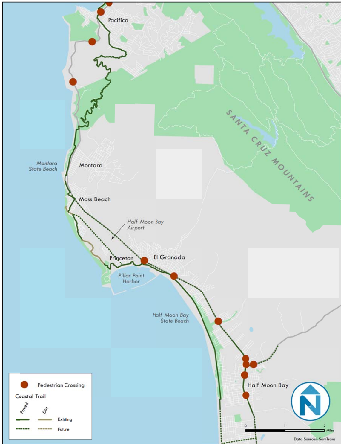
Figure 3 - Existing and Future Coastal Trail and Parallel Trail Facilities