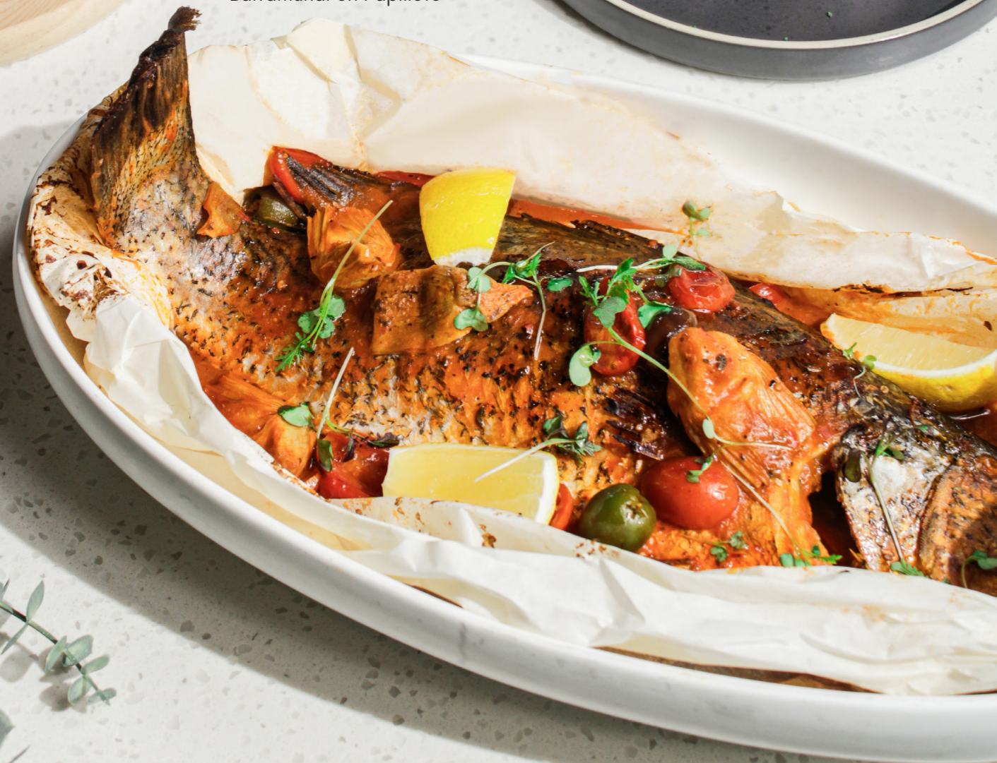
Barramundi en Papillote