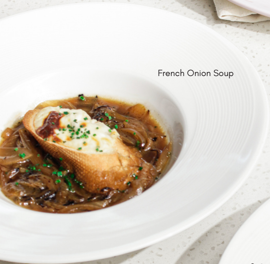
French Onion Soup