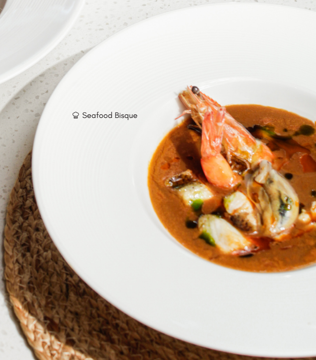
👨‍🍳 Seafood Bisque