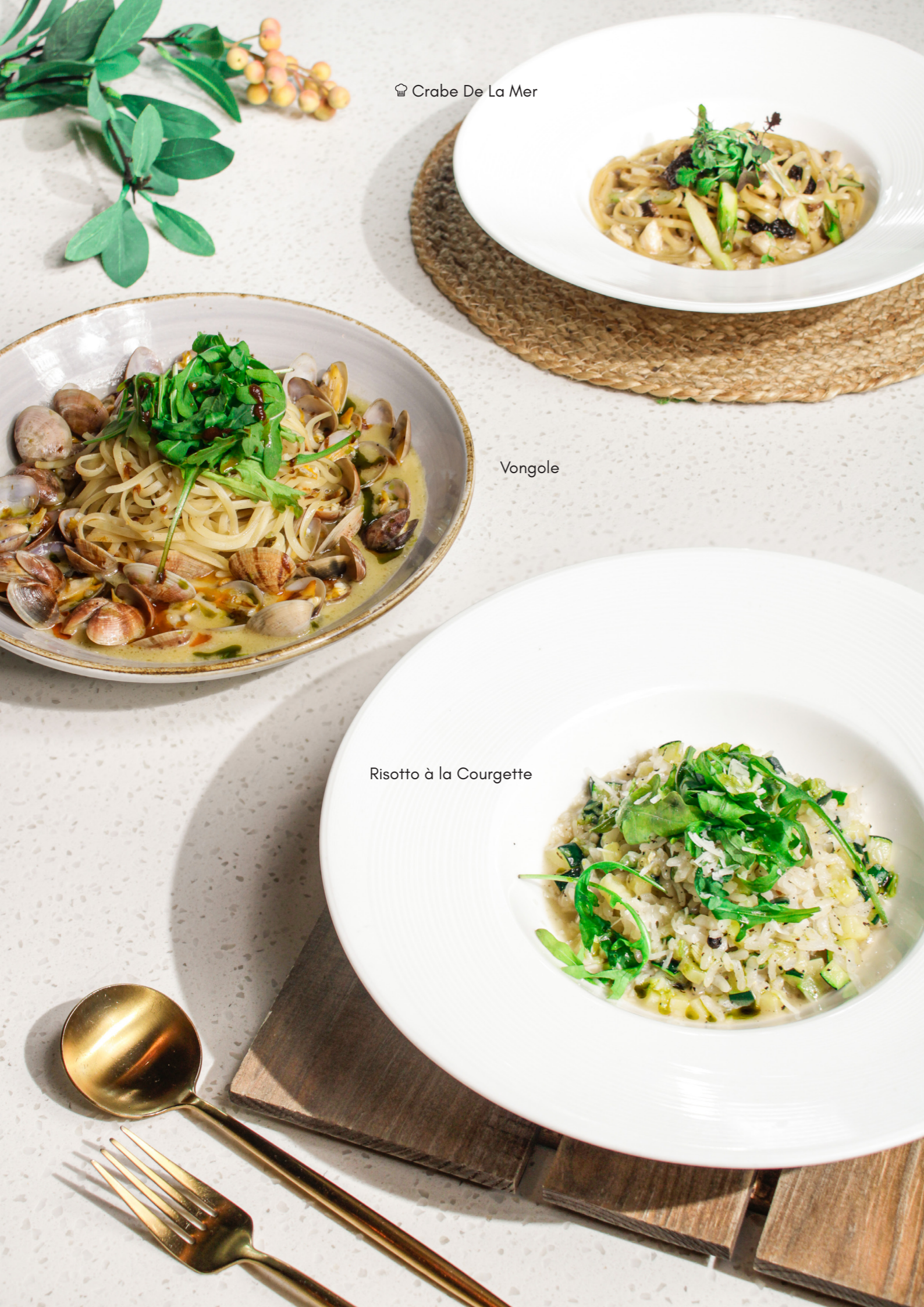
👨‍🍳 Crabe De La Mer