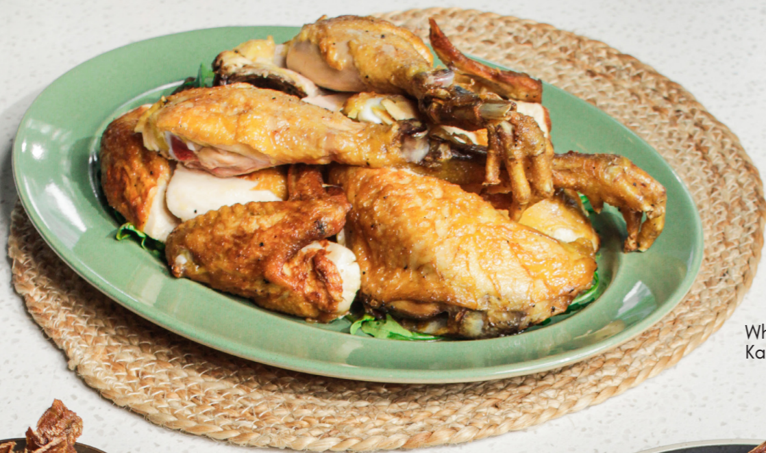
Whole Roasted Santori Kampung Chicken