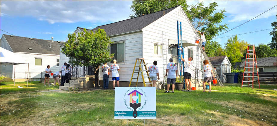
16 Homes painted for our 42nd Annual Paint Your Heart Out event with over 250 volunteers.

Revitalizes neighborhoods by rehabilitating vacant and abandoned properties, developing unused land, and constructing mixed-income single and multifamily housing, significantly strengthening and adding to the local housing stock and fostering long-term community renewal. • 25 mixed-income single-family units in the final pre-construction stages for an anticipated investment of $16MM over the next 18 months. • 20 Mixed-income single-family units in initial design phase for an anticipated investment of $10MM over the next 36 months. • Completed infrastructure of our 12 lot Tripp Lane subdivision development in Murray. • Provided project oversight and construction management for 15 home rehabilitation grant projects for a preservation investment of $4,960,000. • Provided project oversight and construction management for two home rehabilitation loan projects for a preservation investment of $799,500. • Sold our 2 newly constructed single-family Cannon Oaks homes for an investment of $1,050,000 back into the community. • Installed a new solar and battery storage system on our Jackson corner commercial property.