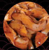
Teriyaki Chicken (100gm) $9.90