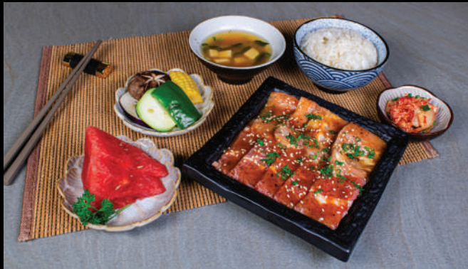
Garlic Miso Set $19.90 Iberico Pork Collar (60gm) Iberico Pork Jowl (60gm)