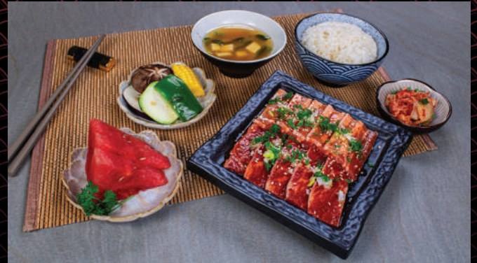
Kimchi Negi Shio Set $22.90 US Kurobuta Belly (60gm) Australia Wagyu Short Plate (60gm)