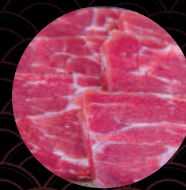
US Kurobuta Collar (60gm) $10.90