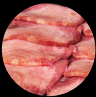
Gyu Tan Negi Shio (100gm) $14.90