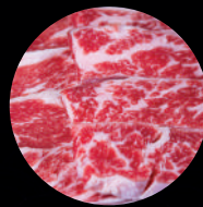
Australian Wagyu Chuck Short Ribs (100gm) $16.90