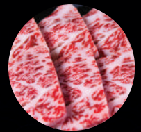
A5 Ibaraki Striploin (60gm) $29.90