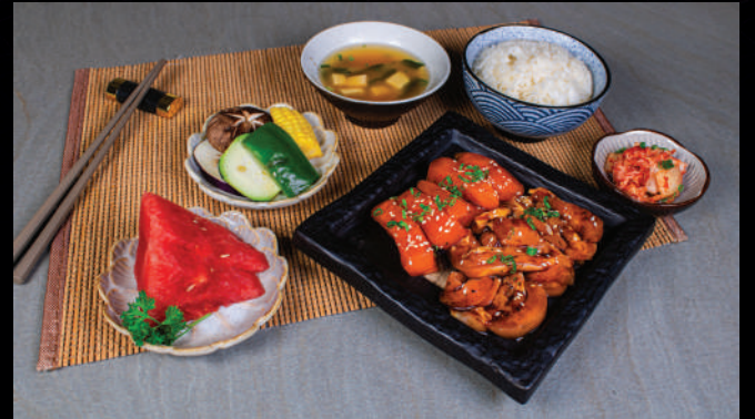
Teriyaki Sesame Set $16.90 Chicken Thighs (100gm) Fresh Salmon (50gm)