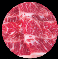
Australian Wagyu Oysterblade (100gm) $16.90