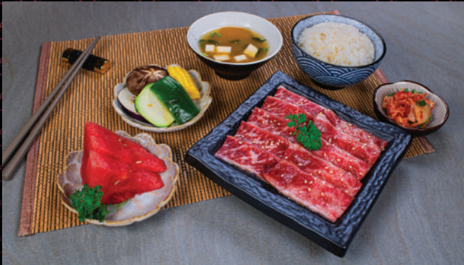
Tajimaya Karubi Set $25.90 Australia Wagyu Short Ribs (60gm) Australia Wagyu Flap Meat (60gm)