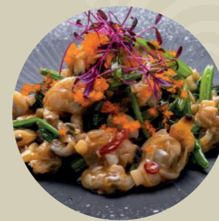
Chuka Spicy Asari Clams