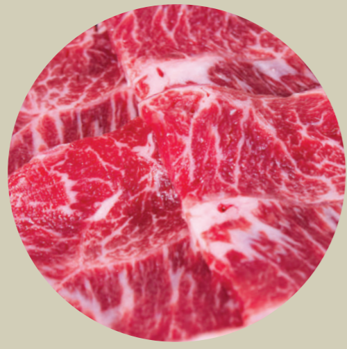
MS 6/7 Australia Wagyu Oysterblade (Tare)