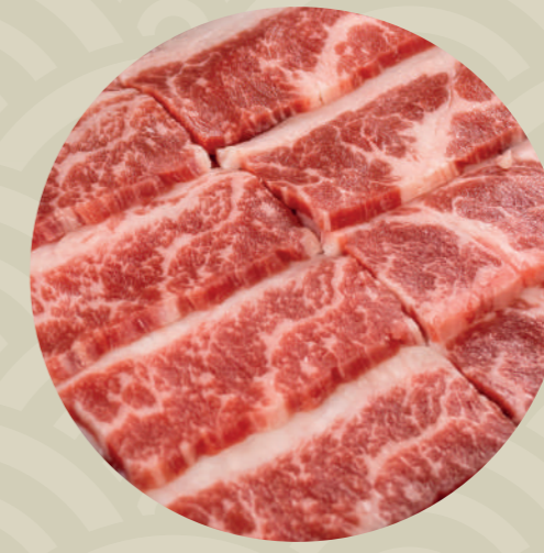
MS 5/6 Australia Wagyu Wagyu Flap Meat