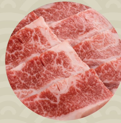
MS 6/7 Australia Wagyu Short Plate