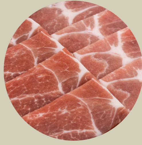
Iberico Pork Collar (Garlic Miso)