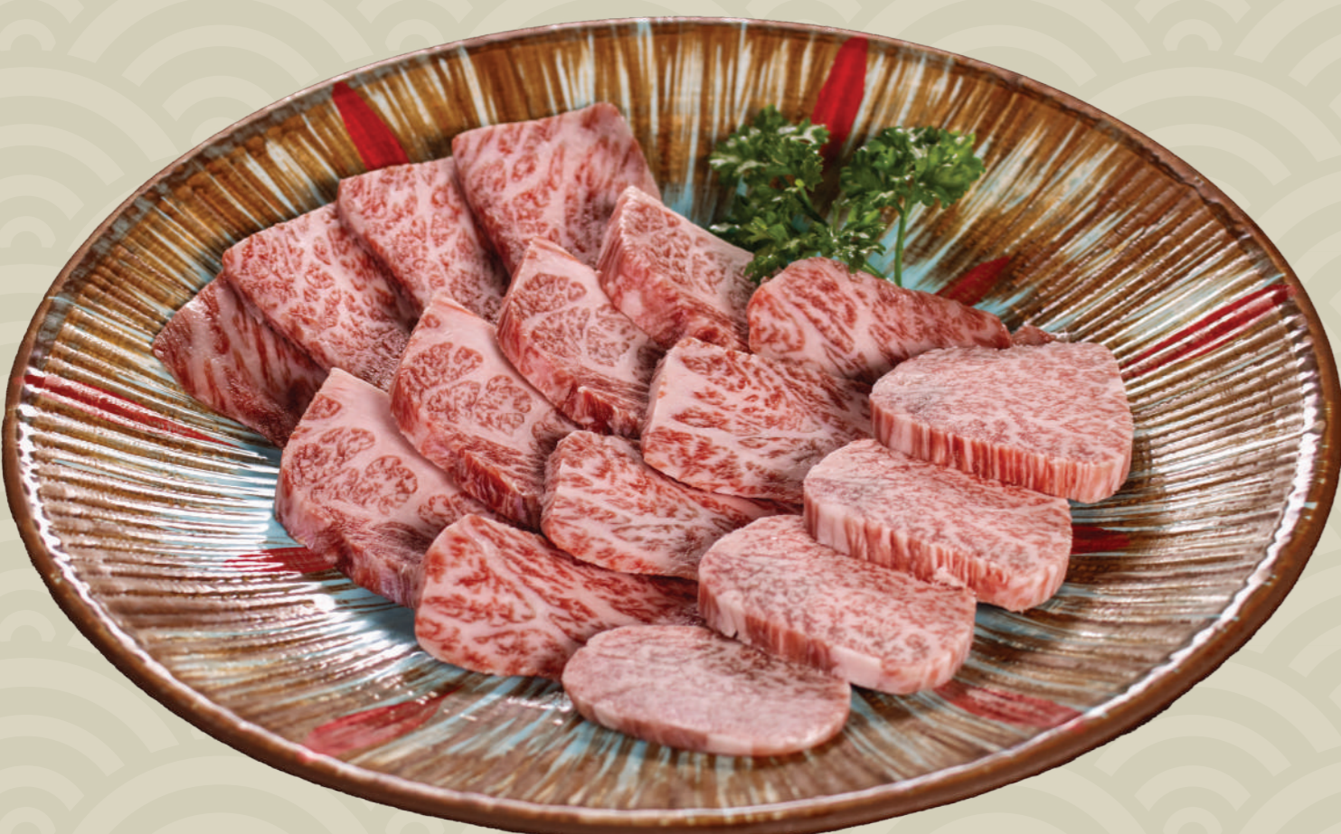
A5 Japanese Wagyu Beef Platter 黒毛和牛盛り合わせ