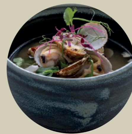
Asari Clam Soup