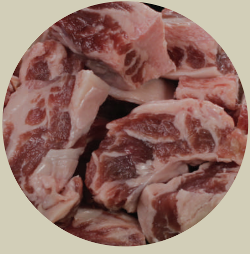
Prime Ribs Finger (Kimchi)