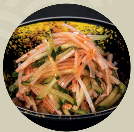
Spicy Kani Salad