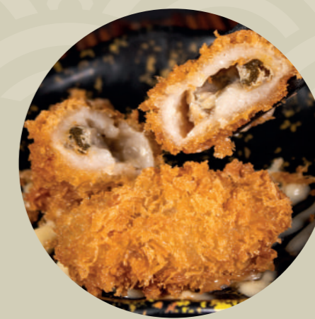
Kaki Fry Breaded Oyster