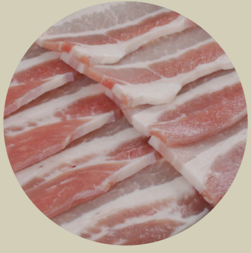
Kurobuta Pork Belly (Kimchi)