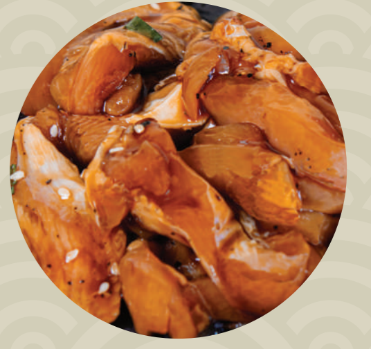
Chicken Thighs (Teriyaki)