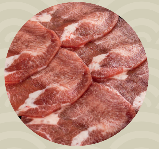
Australia Ox Tongue