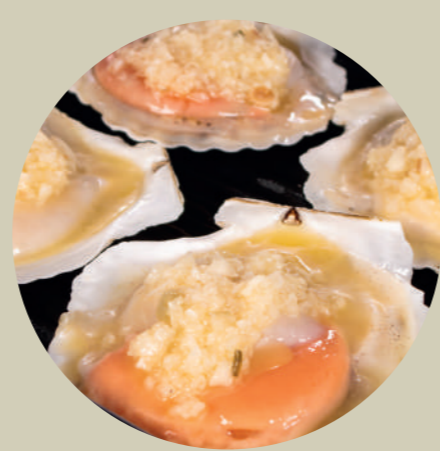
Garlic Butter Half Shell Scallop