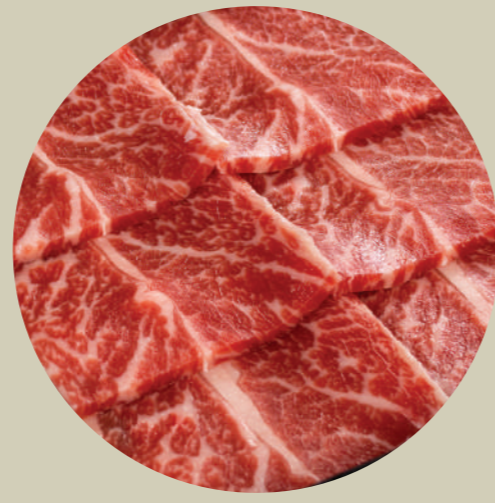
MS 6/7 Australia Wagyu Beef Short Ribs