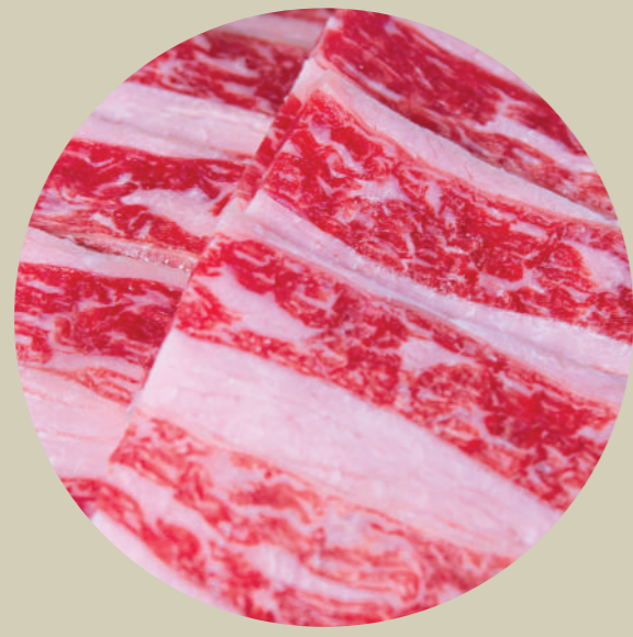
US Karubi Plate