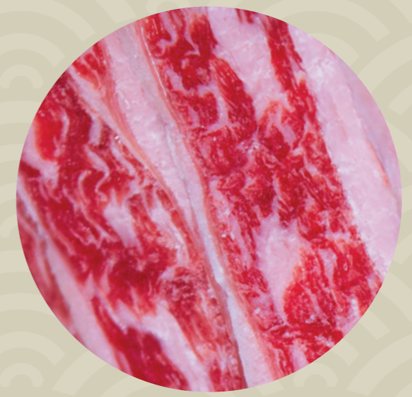
Australia Karubi Plate