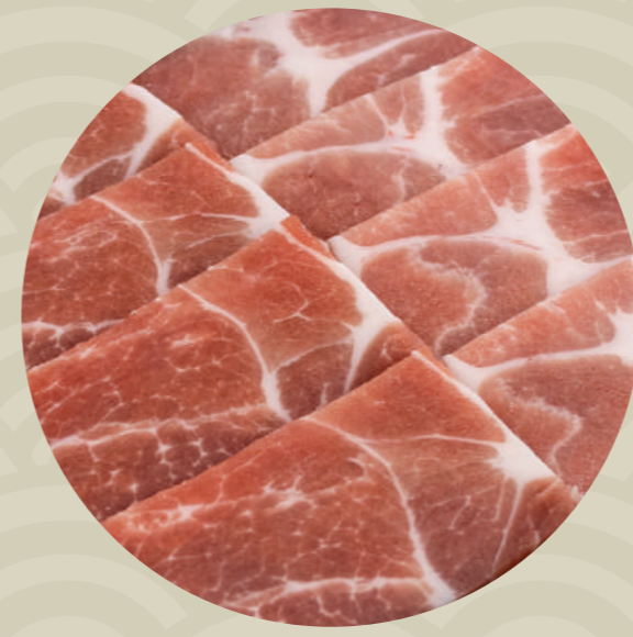
Garlic Miso Pork Collar