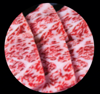
A5 Japanese Wagyu Striploin (60gm) $29.90