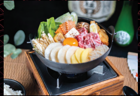
Sukiyaki Beef Set (100gm) $17.80 Sukiyaki Pork Set (100gm) $15.80 A Japanese favourite, Sukiyaki is a perfect blend of sugar and bonito stock added to a base of brewed soy sauce. Australia Wagyu Beef Short Ribs / US Kurobuta Pork with Rice