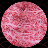
A5 Japanese Wagyu Karubi Plate (60gm) $19.90