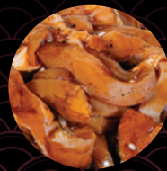
Teriyaki Chicken (100gm) $9.90