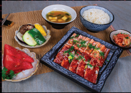
Australia Wagyu Beef & US Kurobuta Pork Set (120gm) $16.90 Australia Wagyu Short Ribs & Kurobuta Pork Belly, Rice, Miso Soup, Kimchi, Vegetables. Watermelon