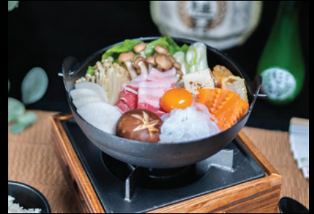
Shabu Shabu Beef Set (100gm) $18.80 Shabu Shabu Pork Set (100gm) $16.80 A classic broth made from simmered kelp and kombu stock that is low in calories and light on the palate. Australia Wagyu Beef Short Ribs / US Kurobuta Pork with Rice