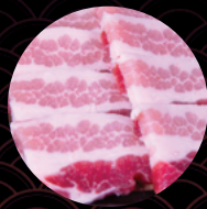
US Kurobuta Pork Belly (120gm) $10.90