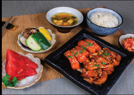
Teriyaki Chicken & Salmon Set (120gm) $16.90 Teriyaki Chicken, Salmon, Rice, Miso Soup, Kimchi, Vegetables. Watermelon