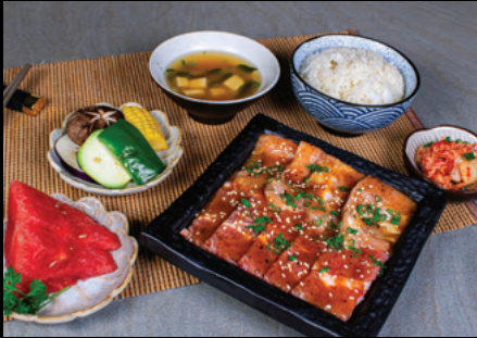
US Kurobuta Pork Set (120gm) $16.90 US Kurobuta Pork Belly & Pork Collar, Rice, Miso Soup, Kimchi, Vegetables. Watermelon