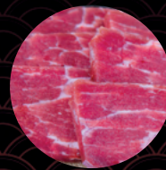
US Kurobuta Pork Collar (120gm) $10.90