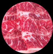
Australian Wagyu Oysterblade (120gm) $12.90