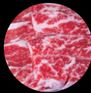
Australian Wagyu Chuck Short Ribs (120gm) $12.90