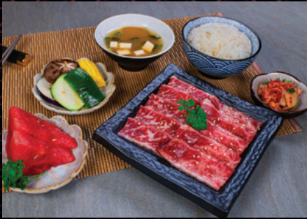
Australia Wagyu Beef Set (120gm) $16.90 Australia Wagyu Beef Short Ribs, Rice, Miso Soup, Kimchi, Vegetables. Watermelon