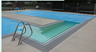
*Images of the new Tonasket Pool