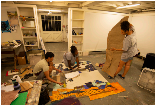
CVA Artists working collaboratively in their studios at the Chautauqua Institution.

While we have presented a variety of exciting exhibitions and programs this spring and summer, we are also working on some longer term projects: