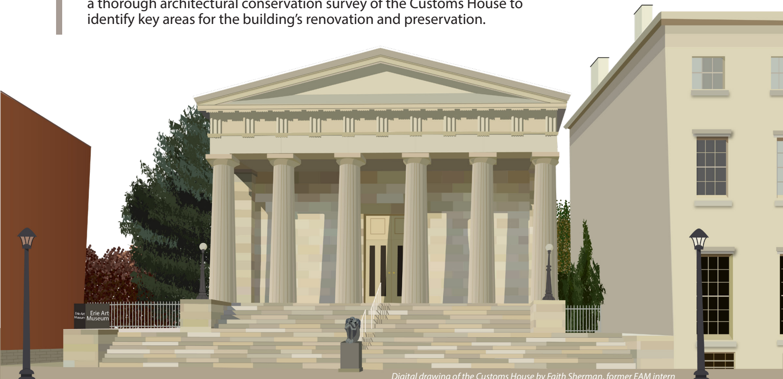
Digital drawing of the Customs House by Faith Sherman, former EAM intern

Pennsylvania Historical & Museum Commission