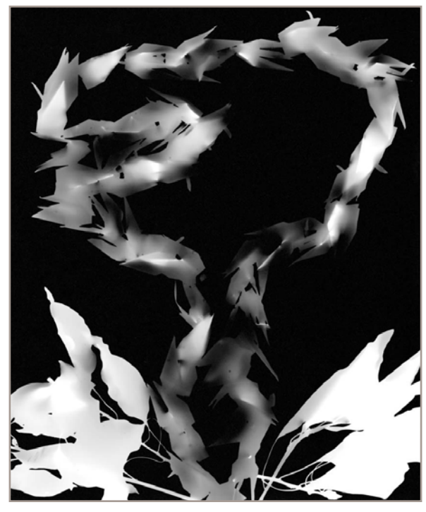
elin o'Hara slavick, Fukushima Persimmon Tree Heavy with Contaminated Fruit II, 2019 Solarized silver gelatin print