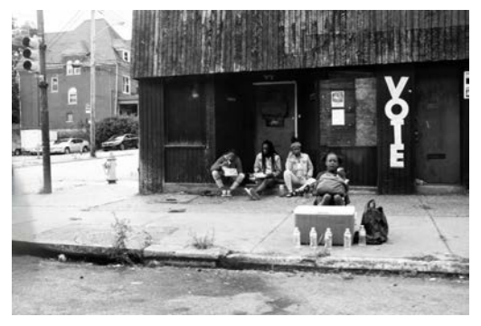
Hustle & Rise, Digital Photograph, Jaime Bird