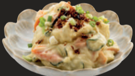
Hokkaido Potato Salad