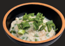
Homemade Chicken Paste