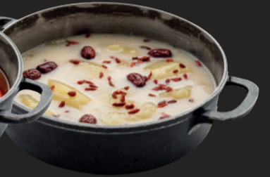
SOY MISO トニュミソ