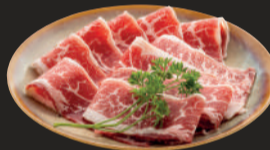
Australia Wagyu Short Ribs