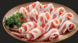
U.S. Beef Short Plate