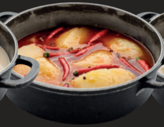
MALA MISO 辛いミソ