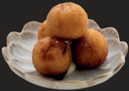
Tako Yaki Ball