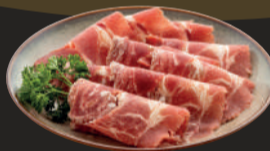
Beef Chuck Roll