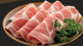
Katara-Su Pork Collar