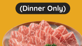
Australia Wagyu Oysterblade