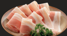
Kurobuta Pork Belly