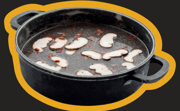
Truffle Mushroom (V) トリュフきのこ

A Japanese favourite, Sukiyaki is a perfect blend of sugar and bonito stock added to a base of brewed soy sauce.