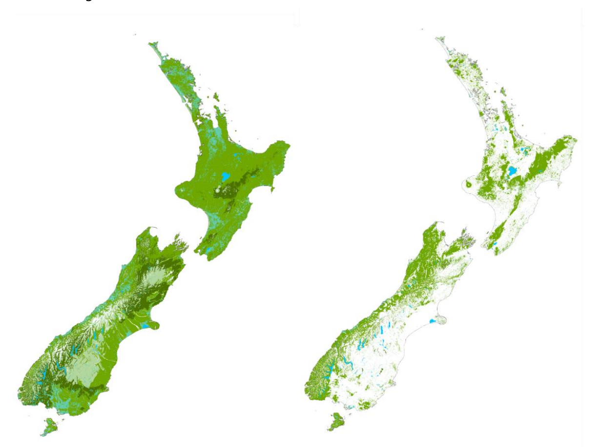
Fig 1a. Aotearoa New Zealand with a complete cloak of native ecosystems before human arrival.

Native ecosystems once cloaked Aotearoa New Zealand. Forests, herb fields, wetlands, sand dunes and many more ecosystems were woven together with diverse and flourishing communities of plants, animals, invertebrates and fungi. Human-driven replacement of these ecosystems with non-native or mixed-origin species assemblages means that native ecosystems now exist in a patchwork of fragments that are much smaller than their original land cover, especially in lowland areas (see Fig 1a & 1b).