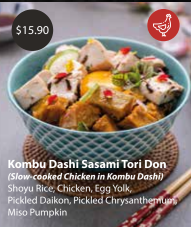
Kombu Dashi Sasami Tori Don