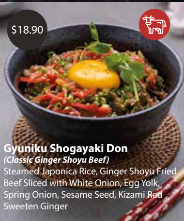
Gyuniku Shogayaki Don