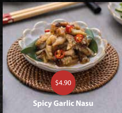
Spicy Garlic Nasu