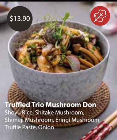
Truffled Trio Mushroom Don

Shoyu Rice, Shitake Mushroom, Shimeji Mushroom, Eringi Mushroom, Truffle Paste, Onion