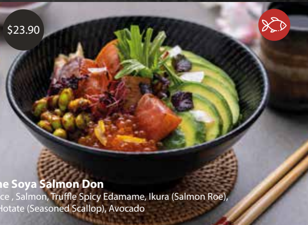
Sesame Soya Salmon Don

Sushi Rice, Salmon, Truffle Spicy Edamame, Ikura (Salmon Roe), Chuka Hotate (Seasoned Scallop), Avocado