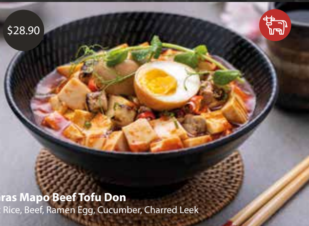
Foie Gras Mapo Beef Tofu Don

Beef Fat Rice, Beef, Ramen Egg, Cucumber, Charred Leek