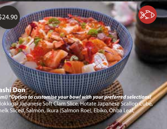
Bara Chirashi Don

(Mixed Sashimi) *Option to customise your bowl with your preferred selections!