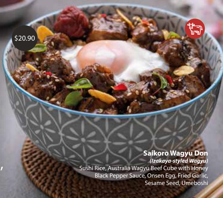
Saikoro Wagyu Don (Izakaya-styled Wagyu)

Sushi Rice, Australia Wagyu Beef Cube with Honey Black Pepper Sauce, Onsen Egg, Fried Garlic, Sesame Seed, Umeboshi